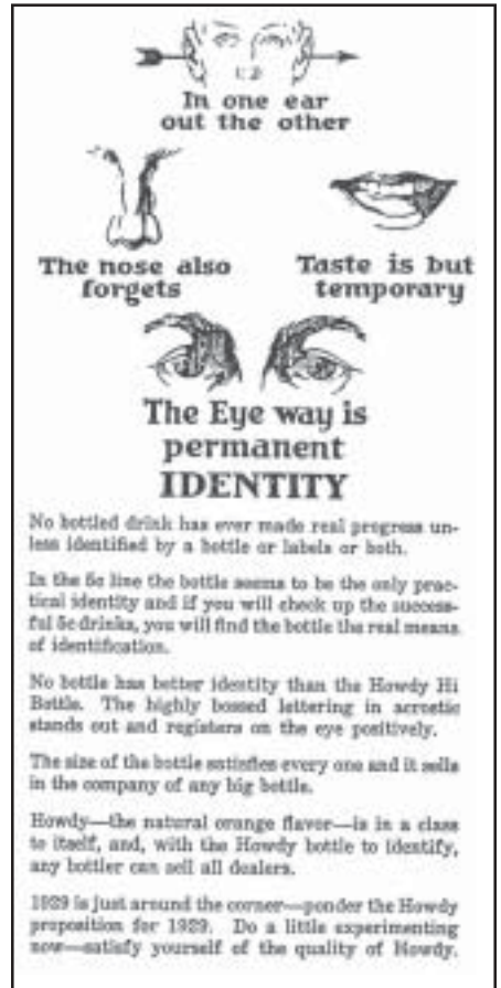
Howdy advertisement from the June 5, 1920 issue of the National Bottlers’ Gazette .