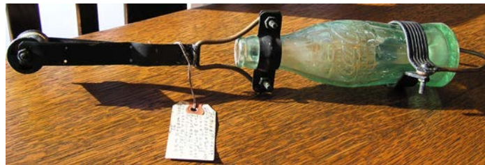
(Fig. 1 WWII Insulator)