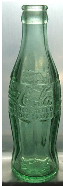
(Fig. 4 "Hobble Skirt" Coke bottle)