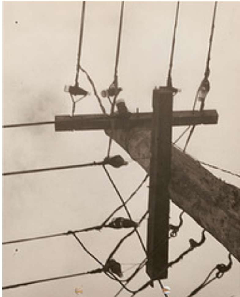
(Fig. 6 Coke bottles being used as insulators during WWII)