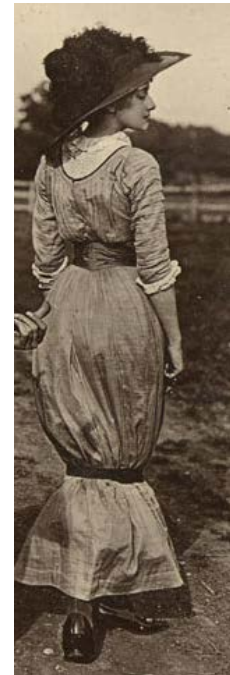
(Fig. 4a Hobble Skirt postcard)

Most of the time the people sending the e-mails or making the phone calls will ask about a specific item and ask what is its value ("price"). For a number of reasons I don't provide price information.