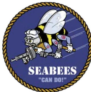
(Fig. 5 Seabees Logo)

FYI: Seabees is a branch of the U.S. Navy’s Construction Battalion [CB] (Fig. 5)